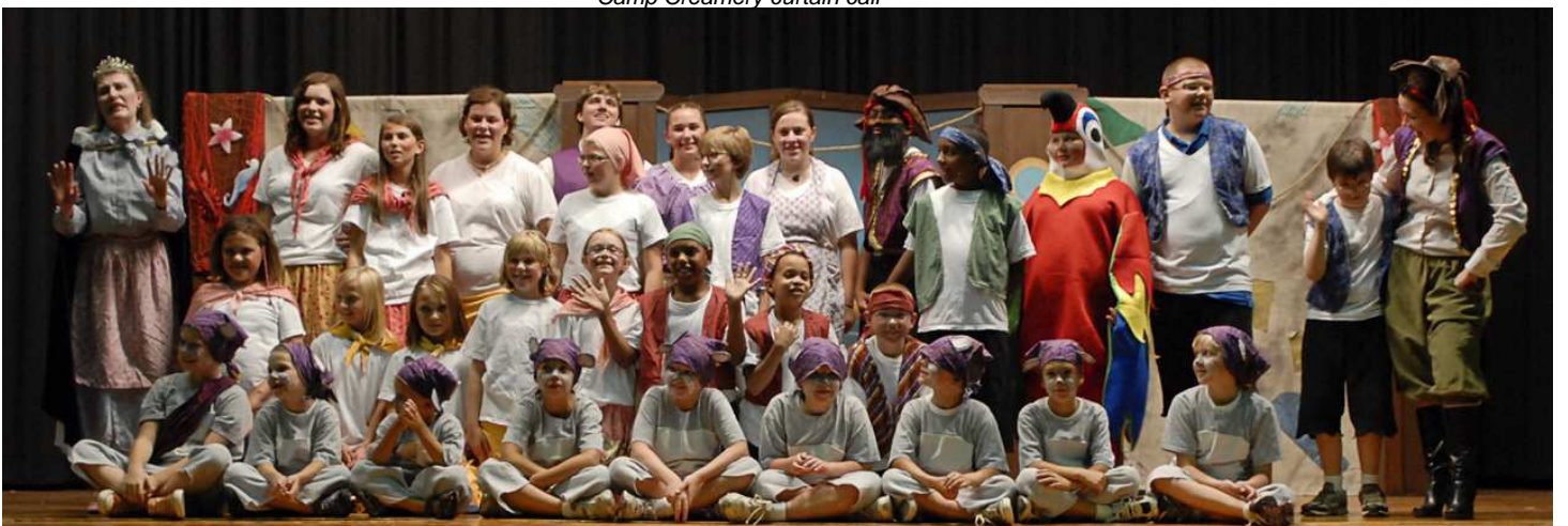
Camp Creamery curtain call

December and can be purchased from K.D. Burkett at kdbphoto@heartofiowa.net .