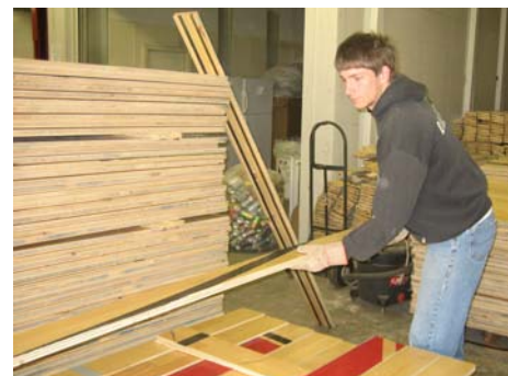
Text and photos by Lalaina Rabary